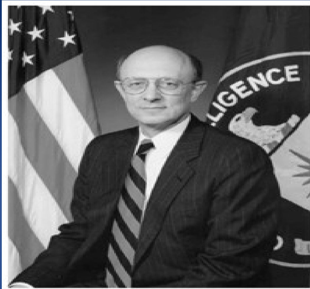
R. James Woolsey, Former Director of Central Intelligence Agency, 1995

"Bioterrorism is the single most dangerous threat to U.S. national security in the foreseeable future"