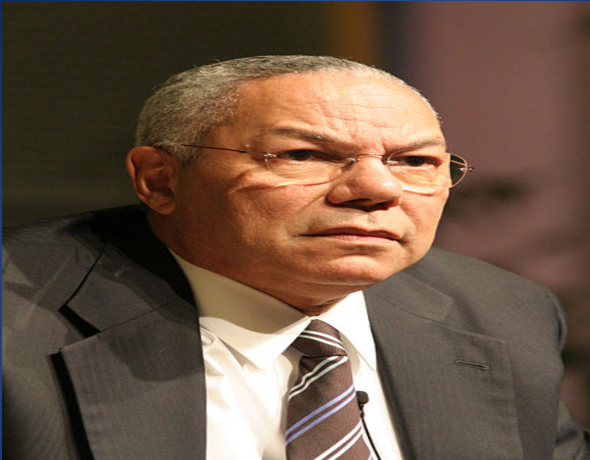
General Colin Powell, 1993

"The one that scares me to death, perhaps even more so than tactical nuclear weapons, and the one we have the least capability against is biological weapons.", 1993