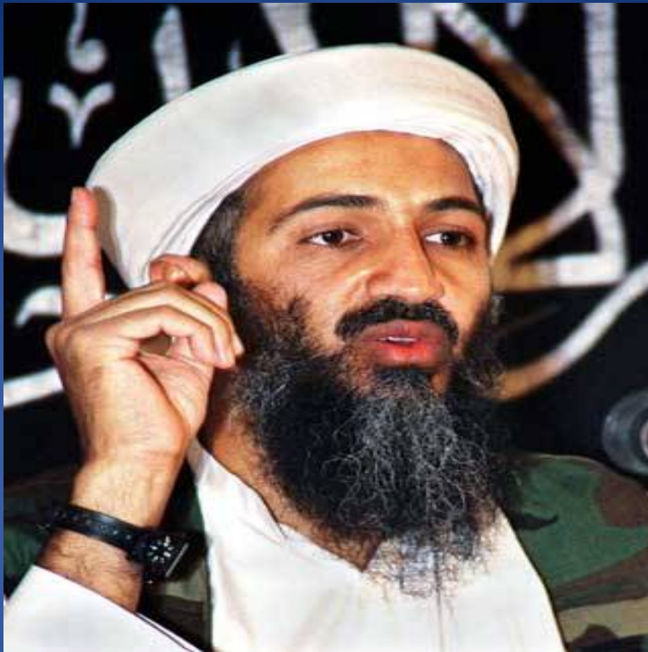
Osama Bin Laden, former leader of Al Qaeda

"Acquiring Weapons of Mass Destruction(nuclear and strategic biological weapons)for the defense of Muslims is a religious duty"- 1998