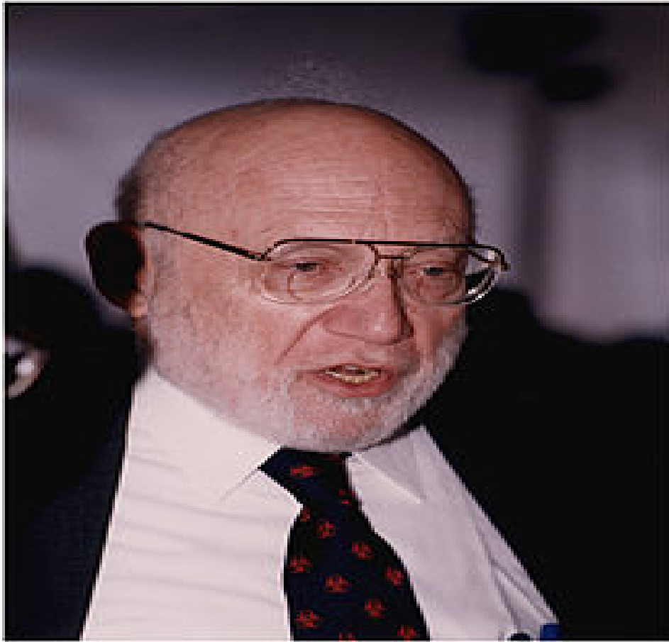
Geneticist & Microbiologist, Dr. Joshua Lederberg, Nobel Laureate

Today one man can make war. A lucky bio buffoon could kill 400,000 people